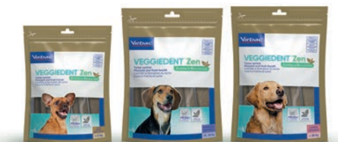
VEGGIEDENT®XS <5kg VEGGIEDENT®M 10-30kg VEGGIEDENT®L >30kg